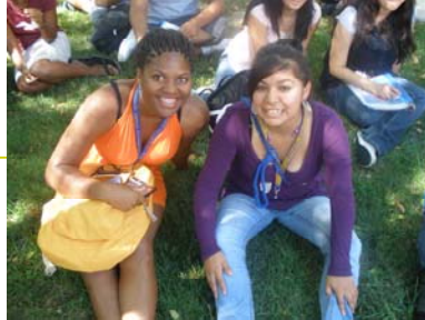
SUMMER TRANSFER ENRICHMENT PROGRAM (STEP)

Program Dates: SITE 1: July 6-10, 2009 SITE 2: August 10-14, 2009 (CANCELLED)