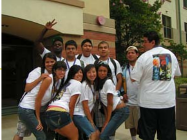
SUMMER INTENSIVE TRANSFER EXPERIENCE (SITE)

SITE is a 5-day residential program that will teach students how to navigate the community college system; complete the appropriate coursework; and maximize their time in order to make a smooth, quick and successful transition to a University of California campus. SITE emphasizes developing strong academic skills and planning for graduate school. SITE explores the role of higher education in our society by focusing on the resources available to students who traditionally do not transfer in high numbers.