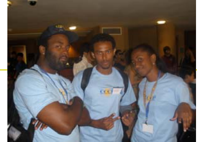
SUMMER TRANSFER PROGRAM (STP)

Program Dates: June 22-July 31, 2009 Orientation: June 19 (1-3PM)