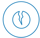
SAN ANDREAS FAULT