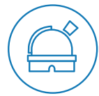
MT. PALOMAR OBSERVATORY

Field trips can enhance the education experience by adding context, making subject matter come alive, and creating a learning community for participating students. Cluster faculty have taken students to more than 30 different destinations, including: