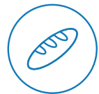
WESTSIDE FOOD BANK