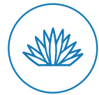
JOSHUA TREE NATIONAL PARK